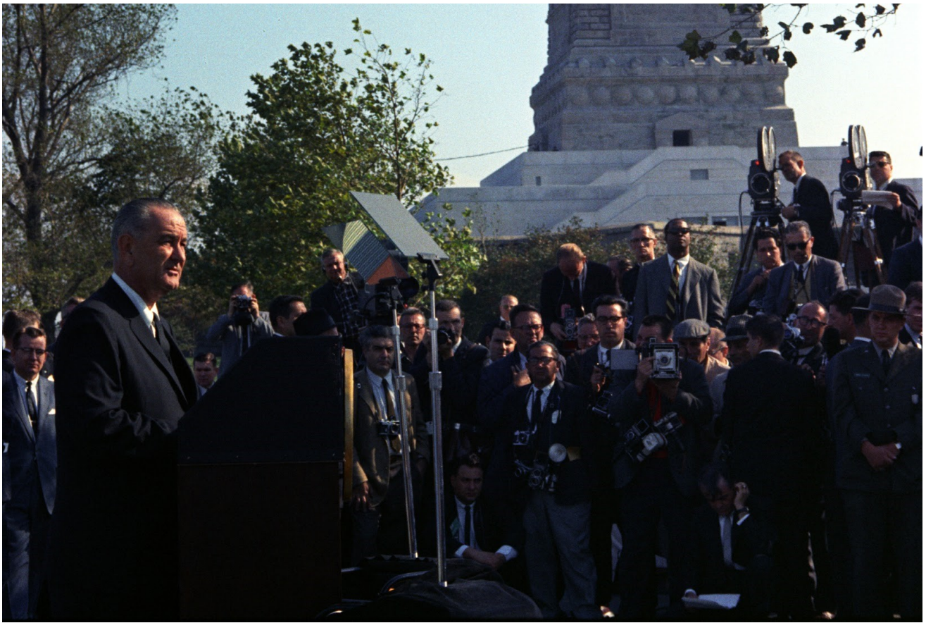
President Lyndon B. Johnson visits the Statue of Liberty to sign the Immigration and Nationality Act of 1965.

The act also set an annual limit on immigrants from Mexico and other Latin American nations. This limitation reinforced the perception that most Mexican immigrants were unskilled workers with little to offer besides cheap labor. Migrant workers continued to receive low wages and remained vulnerable to exploitation by commercial farmers.