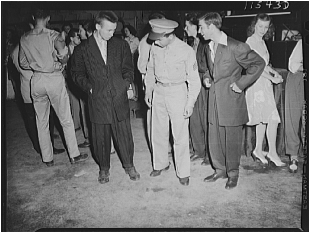
An American soldier observes two young men wearing “zoot suits” at a musical performance in Washington, DC, in 1942.

In the summer of 1943, “Zoot Suit Riots” occurred in Los Angeles after a group of White American sailors, encouraged by White civilians, stripped and beat a group of young Mexican American men wearing flamboyant clothing known as “zoot suits.” Over 100 people were injured during the riots.