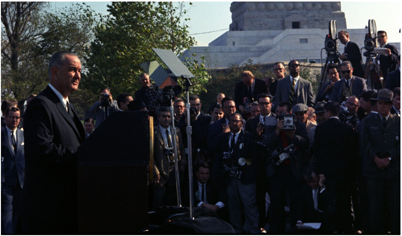
President Lyndon B. Johnson visits the Statue of Liberty to sign the Immigration and Nationality Act of 1965.

The act also set an annual limit on immigrants from Mexico and other Latin American nations. This limitation reinforced the perception that most Mexican immigrants were unskilled workers with little to offer besides cheap labor. Migrant workers continued to receive low wages and remained vulnerable to exploitation by commercial farmers.