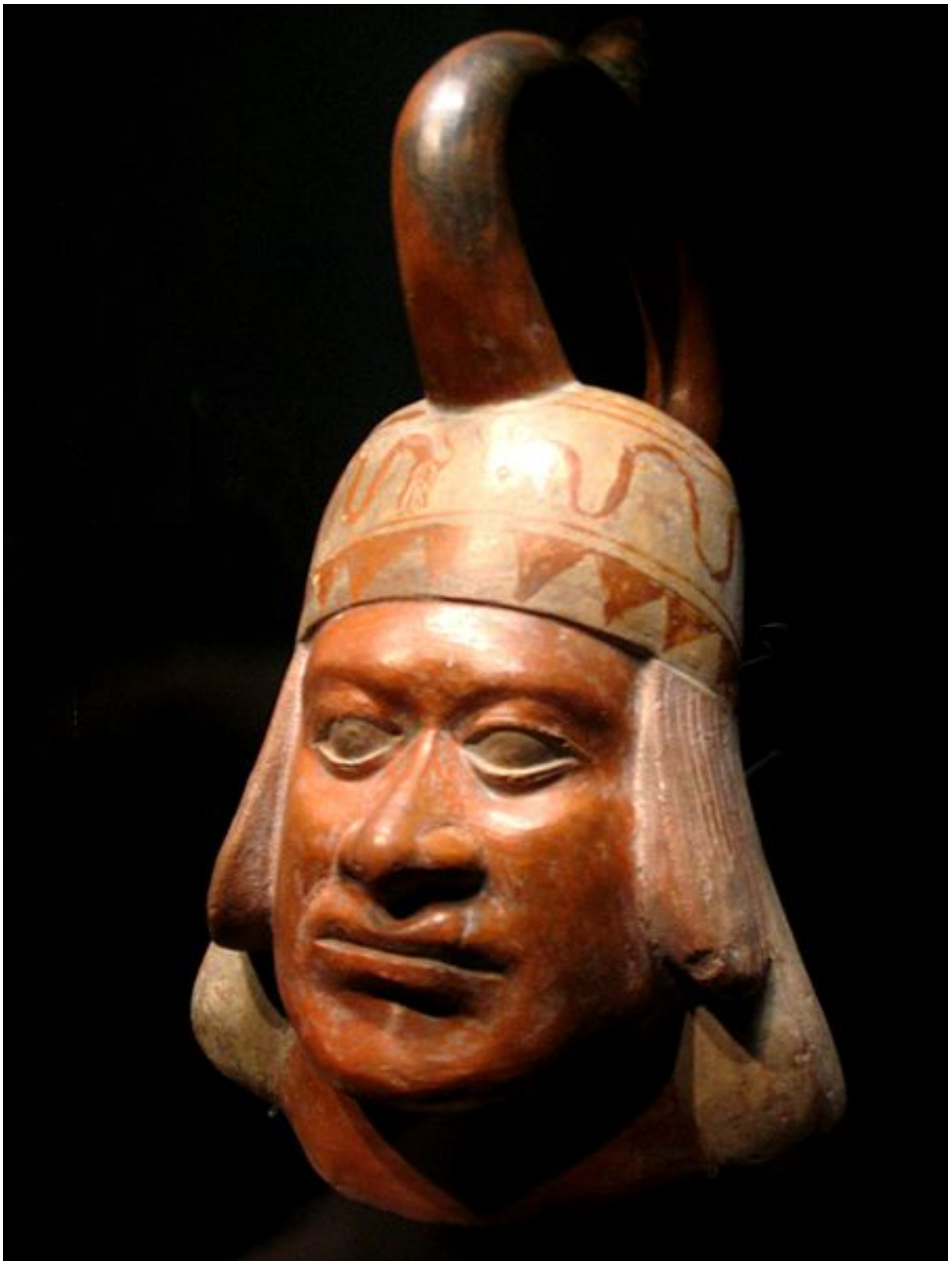
Moche portrait bottles