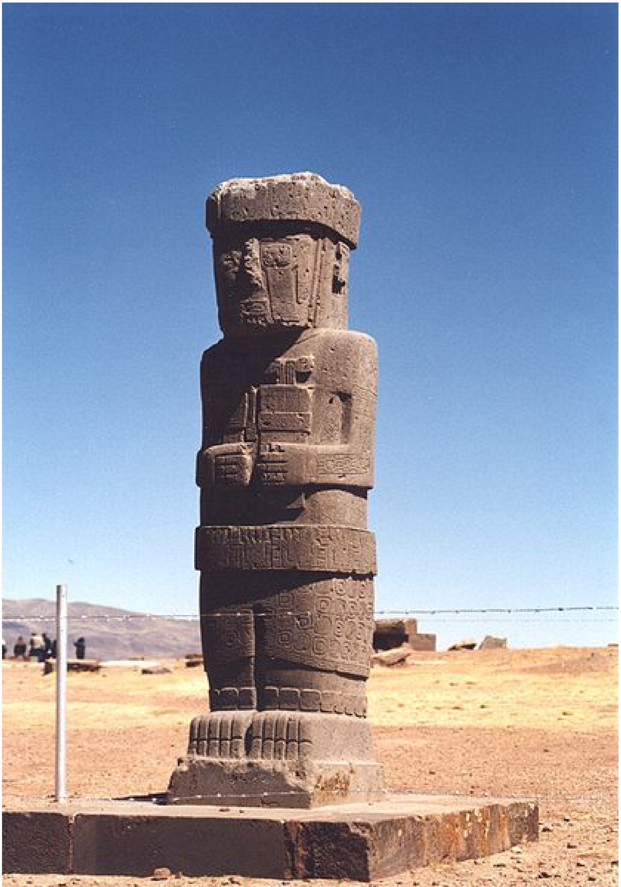
Tiwanaku stela sculpture