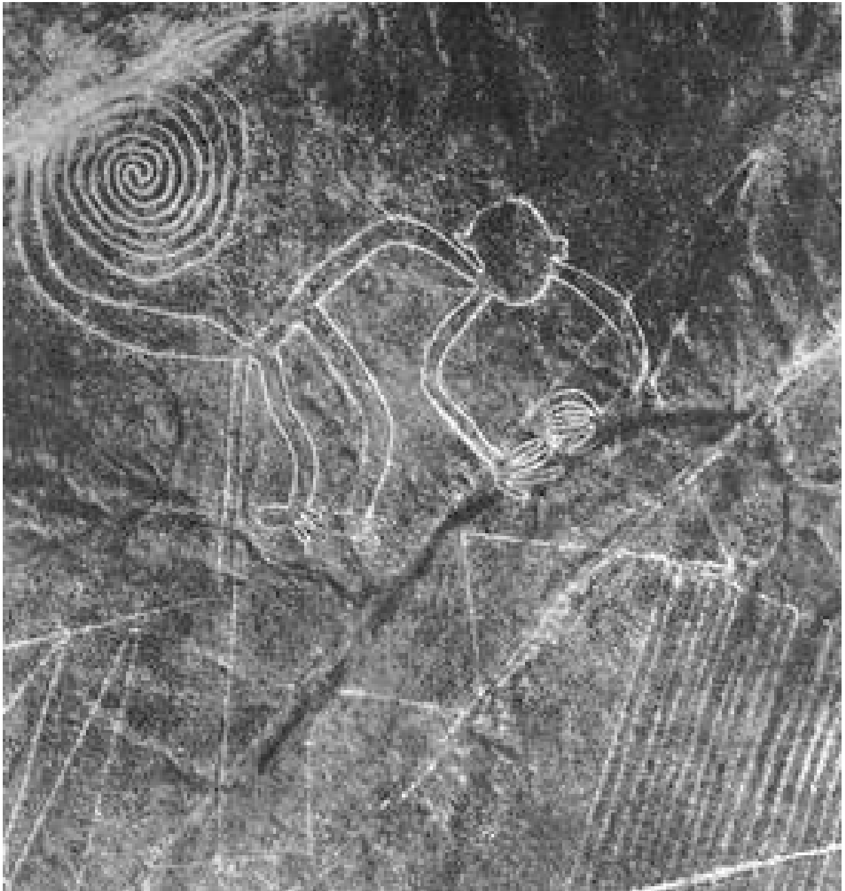
Nazca line images