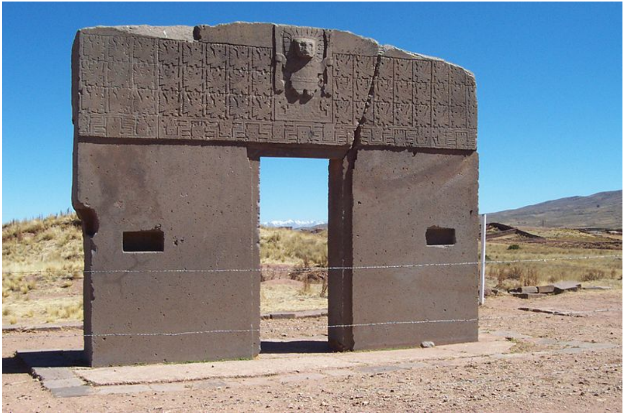
Gateway of the Sun

➞ EXAMPLE Below is an image of the monolithic gateway of the sun.