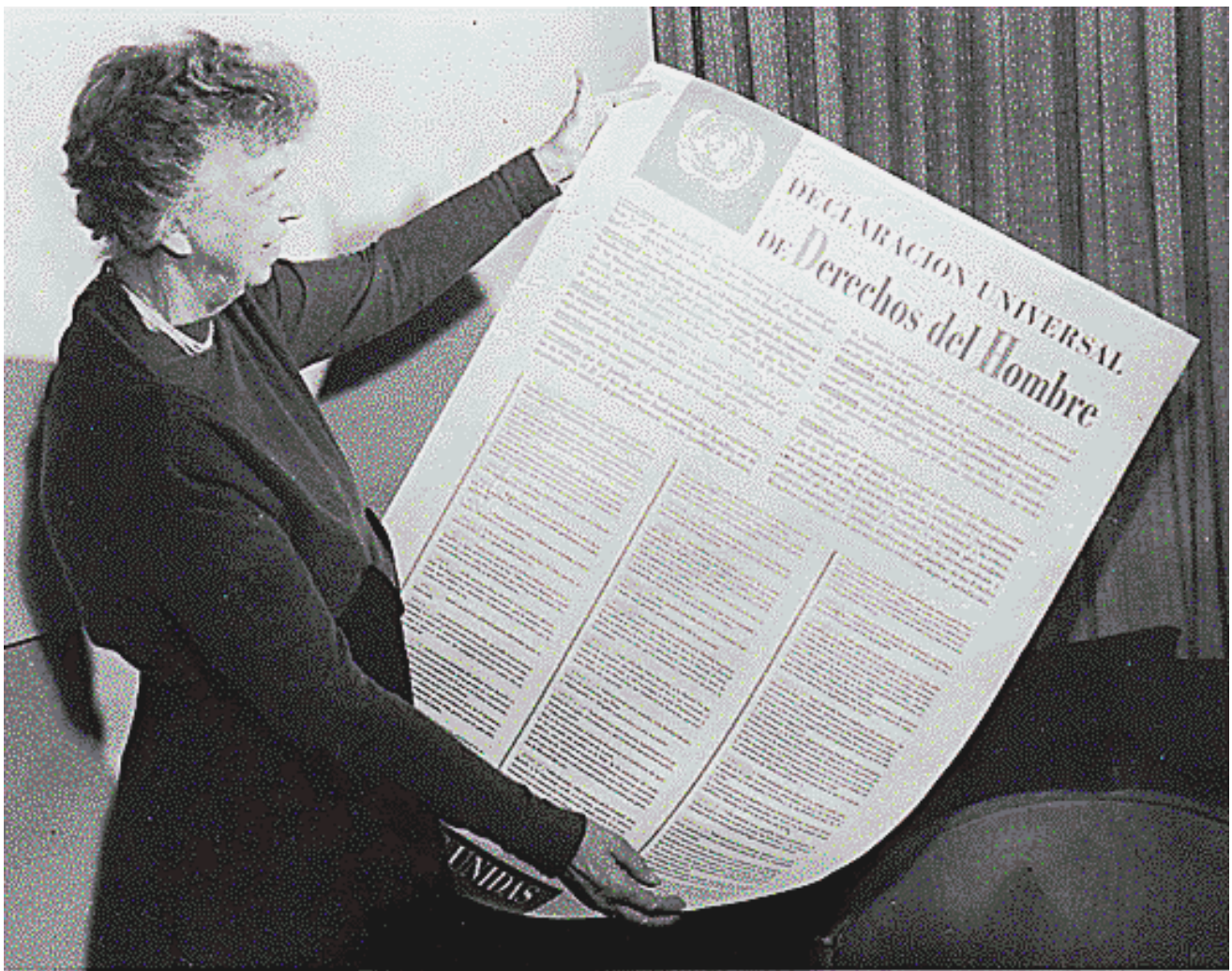
Eleanor Roosevelt examines a draft of the Universal Declaration of Human Rights written in Spanish.

The Universal Declaration was an attempt to address the death and dislocation resulting from World War II. For instance, the genocide committed by Nazi Germany during the Holocaust indicated the need for an international body to investigate human rights abuses during war (and peace).