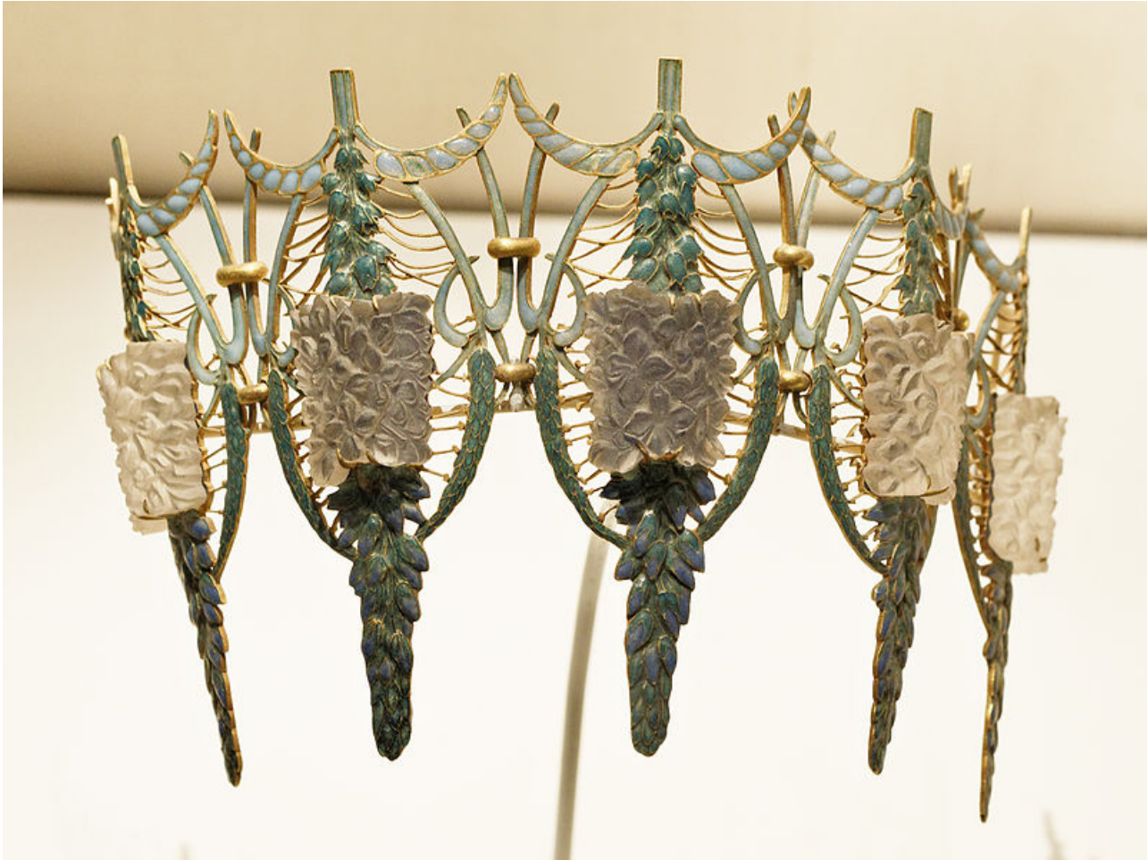
Bangle (bracelet) by René Lalique

The example that you're looking at below is a bangle (or bracelet), an accessory that would be placed on your arm.