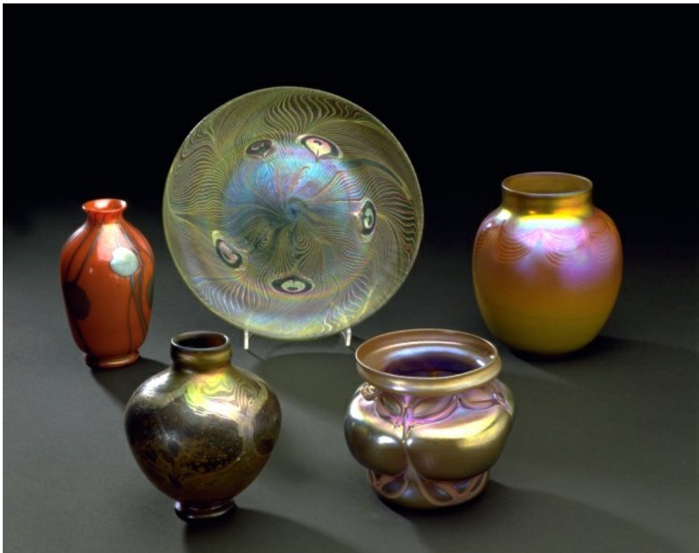
Favrite Glass examples patented by Louis Comfort Tiffany