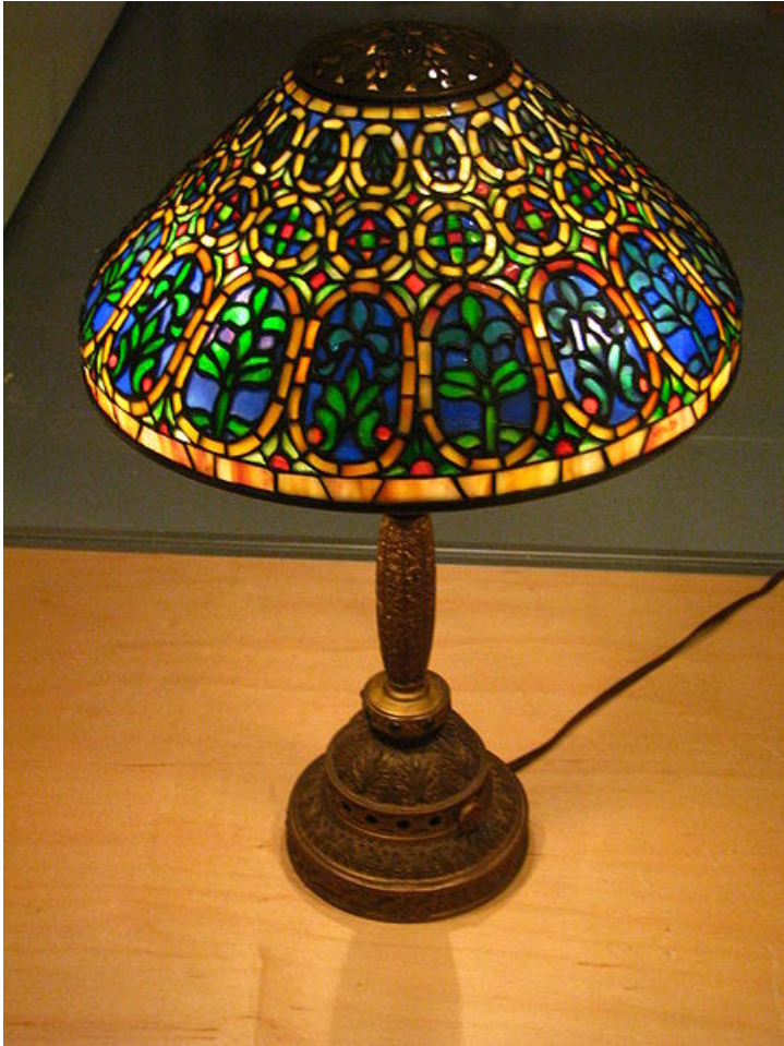
Tiffany Lamp by Louis Comfort Tiffany

One of the most important designers from this period is Louis Comfort Tiffany. You are likely somewhat familiar with him, and may even have some of his inspired work in your home. His interest in glass production led to the development of new types of stained glass and iridescent glass, which he called Favrile glass , both of which he patented and incorporated into his colored glass designs, from windows, mosaics, jewelry, and enamels, to the world-famous lamps that still bear his name. Here is an example of a Tiffany glass lamp: