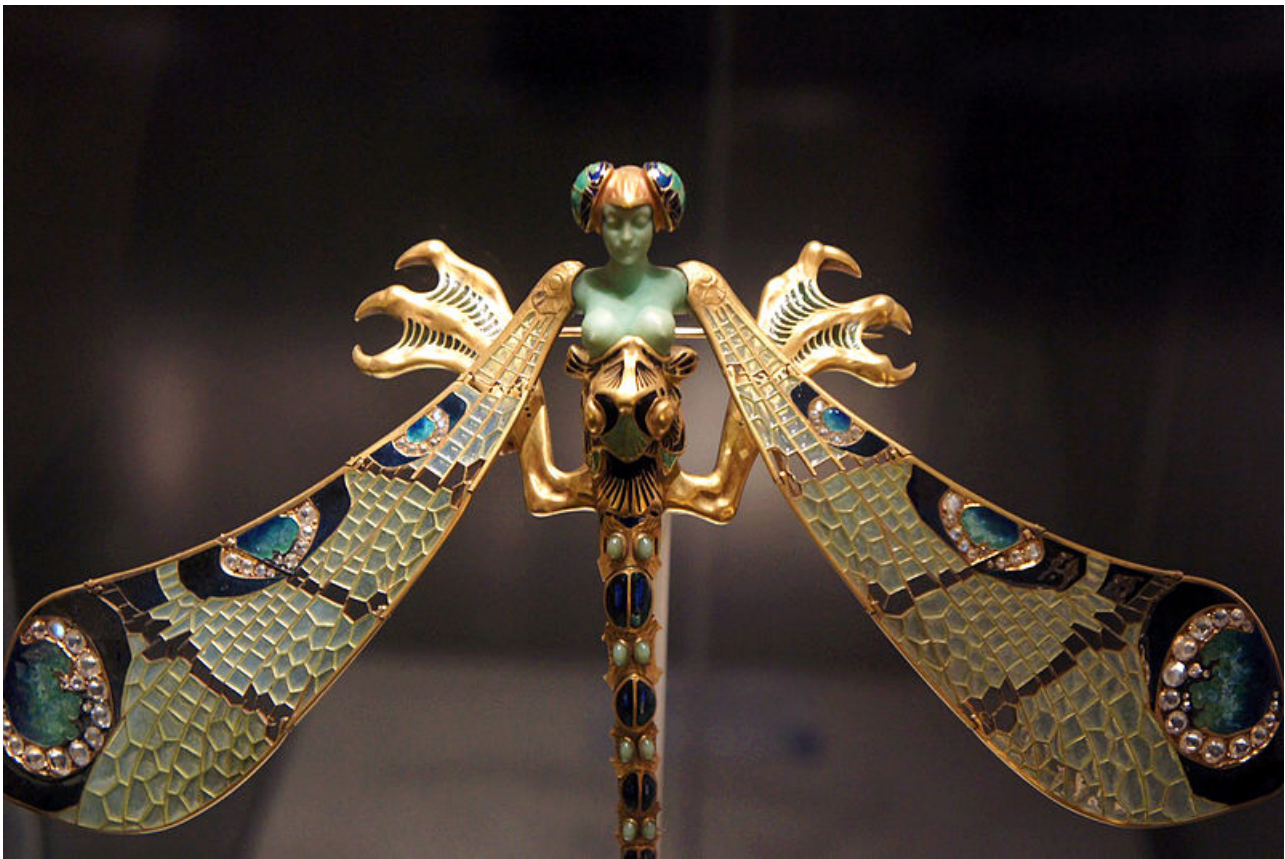
Dragonfly Lady Brooch by René Lalique