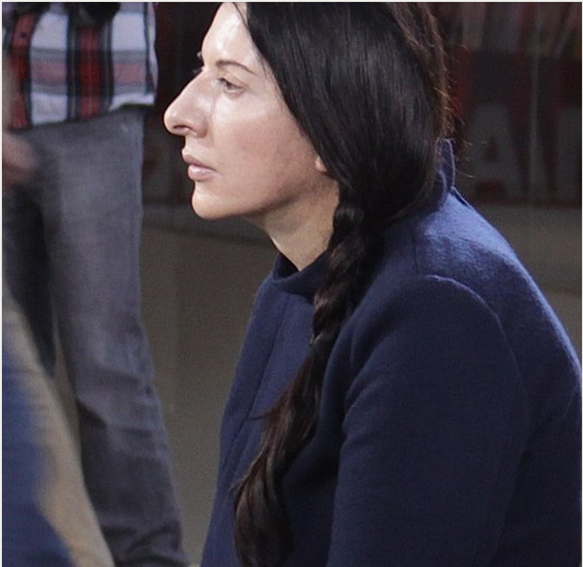
The Artist is Present by Marina Abramovic

First, a picture of Marina Abramovic performing at the Museum of Modern Art in New York. The title of this performance is The Artist Is Present , and the performance consisted of her sitting for hours on end staring at observers.