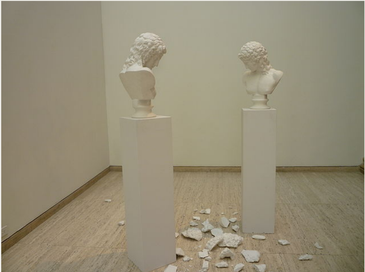
The Other Figure by Giulio Paolini

The Other Figure , a slightly humorous example of Arte Povera, shows two busts looking down upon another figure, which happens to be shattered and in pieces on the ground.