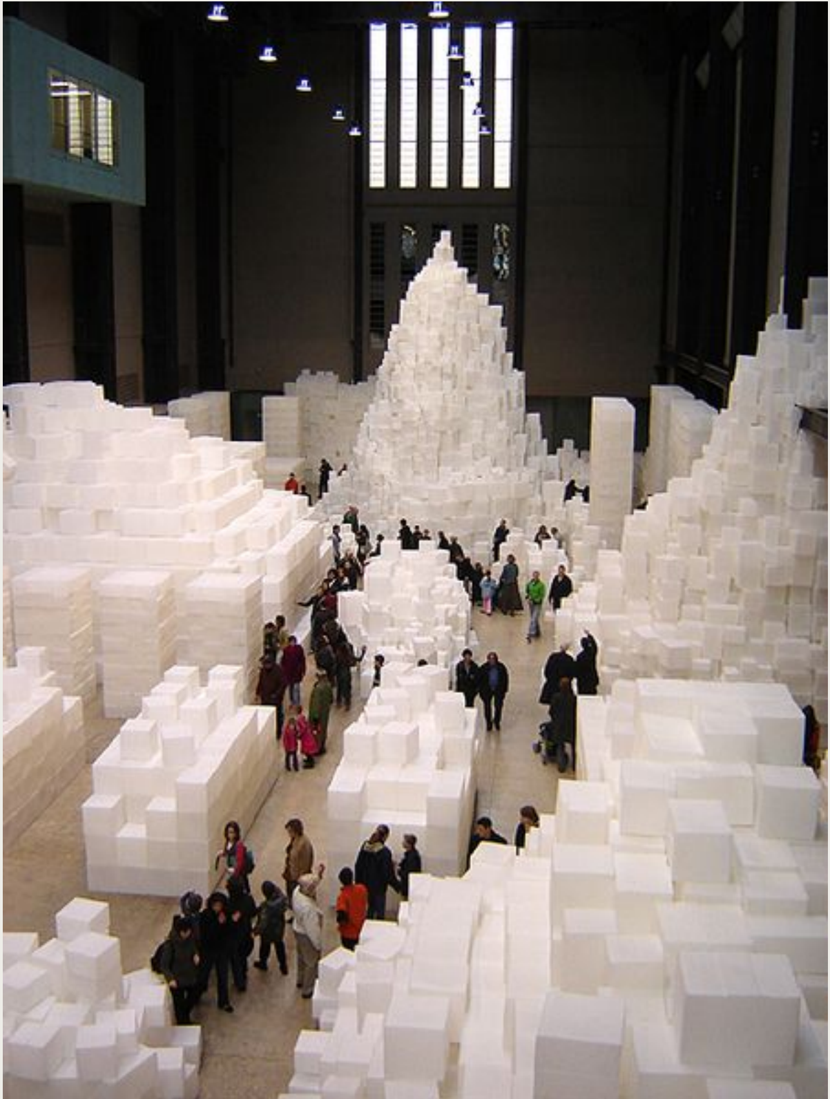
Embankment by Rachel Whiteread

Below is an example of installation art where the surrounding space becomes a part of the medium.