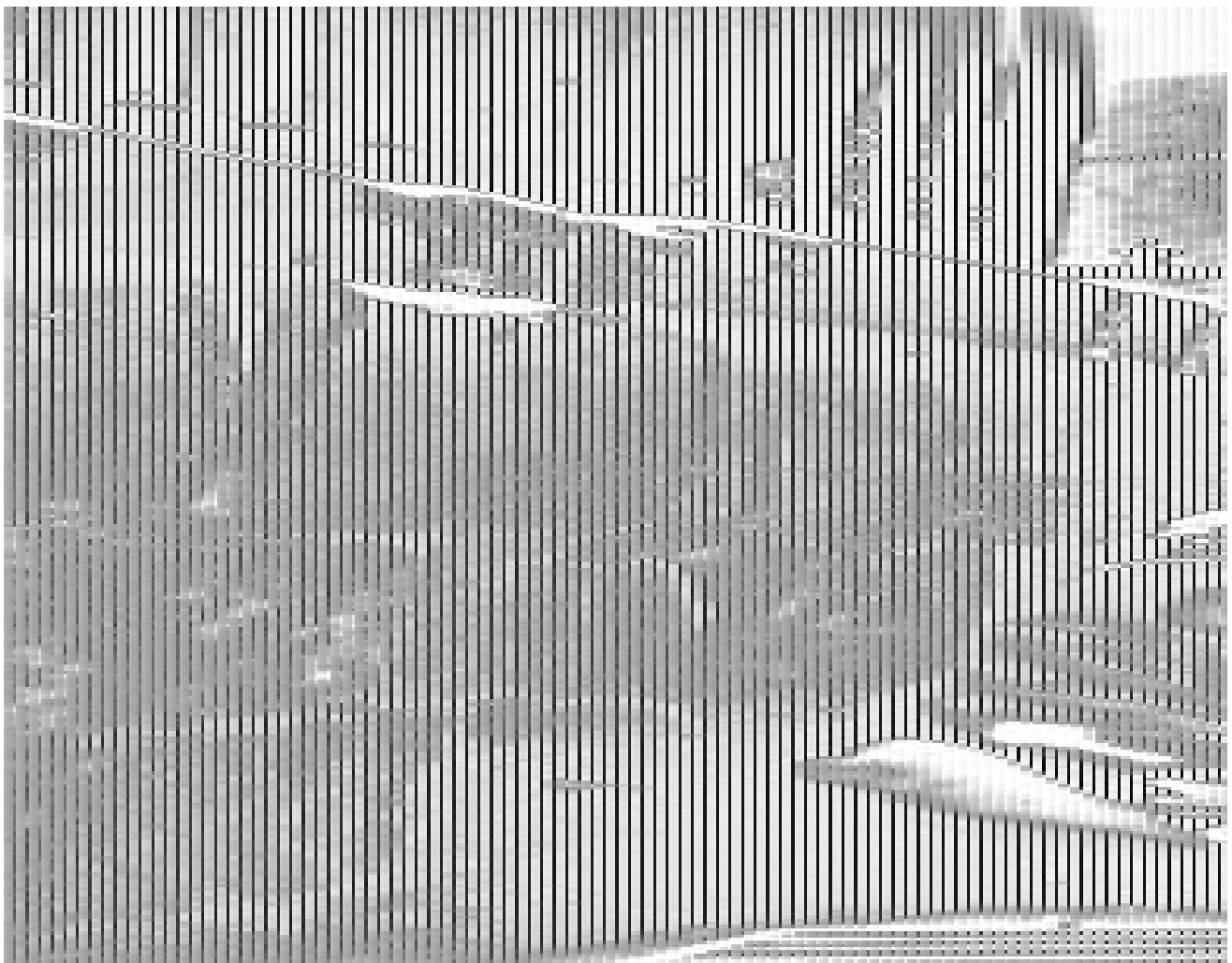
This 1890 photograph, taken by Riis, shows a group of children sleeping near Mulberry Street.