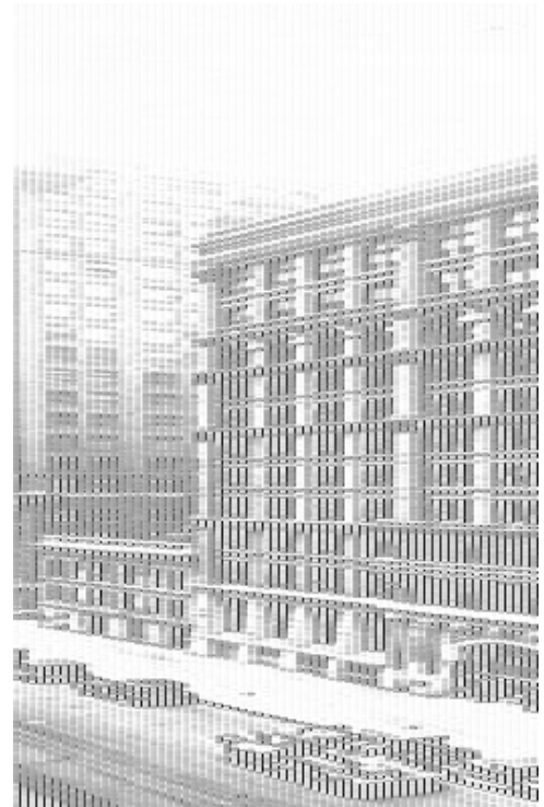
The Home Insurance Building in Chicago, considered the first modern skyscraper in the United States.

The first skyscraper—the 10-story Home Insurance Building—was completed in Chicago in 1885 (pictured below). Although it was possible to build a taller building, due to new steel construction techniques, another invention was required to make taller buildings viable: the elevator. The need was met in 1889, when the Otis Elevator Company, led by inventor James Otis , installed the first electric elevator.