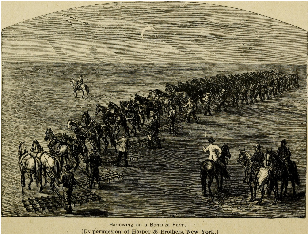
A depiction of a bonanza farm in North Dakota published in a guidebook for the Northern Pacific Railway, 1899.

that increased production. They hired migrant laborers who traveled from farm to farm to operate these machines, harvesting wheat and other crops for urban markets. Many would-be landowners who were lured westward by the promise of cheap land through the Homestead Act became migrant workers on bonanza farms instead, working land owned by others, for wages.