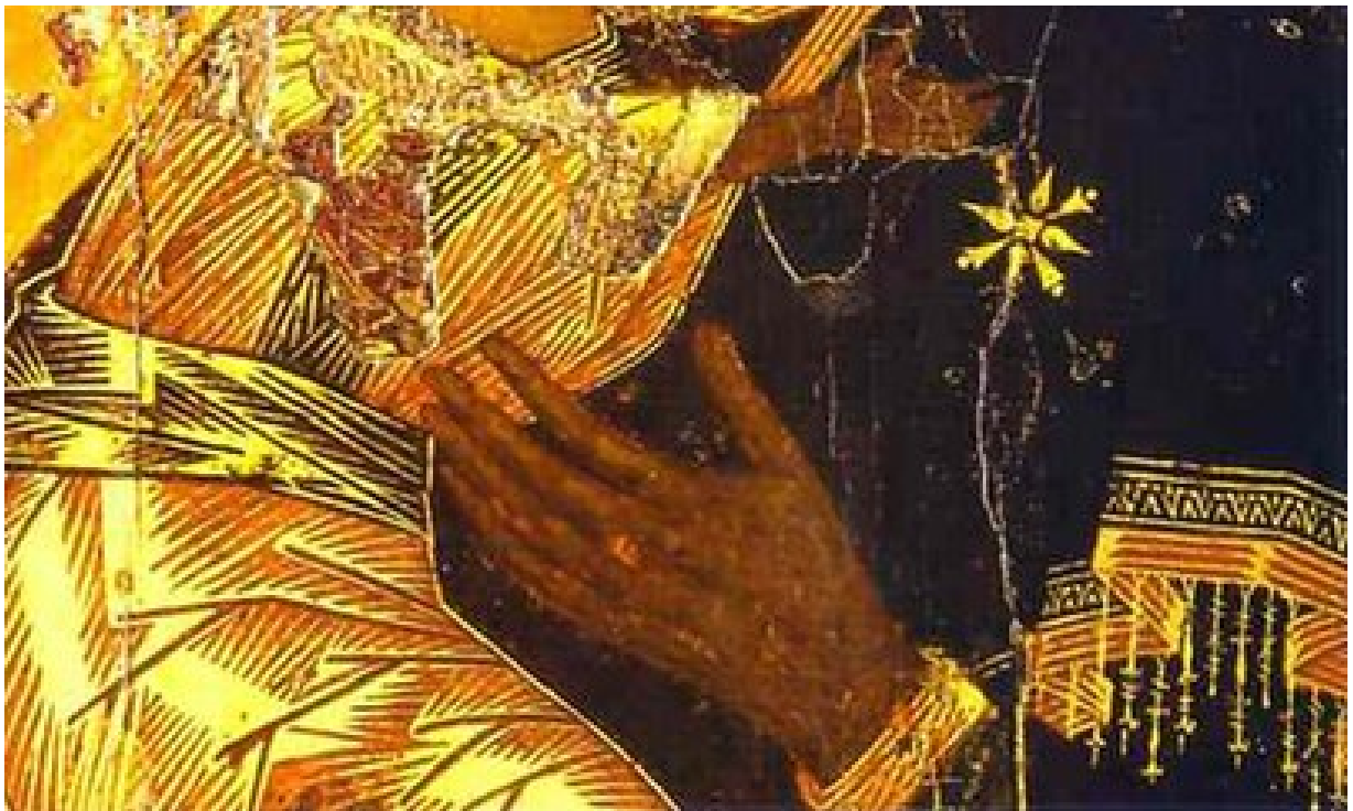
Virgin of Vladimir (Virgin of Child)