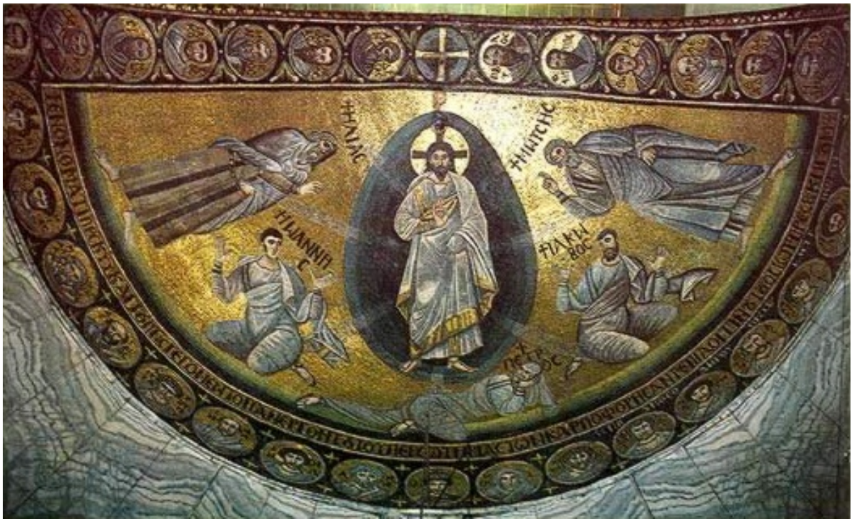
Transfiguration of Jesus at Monastery of St. Catherine