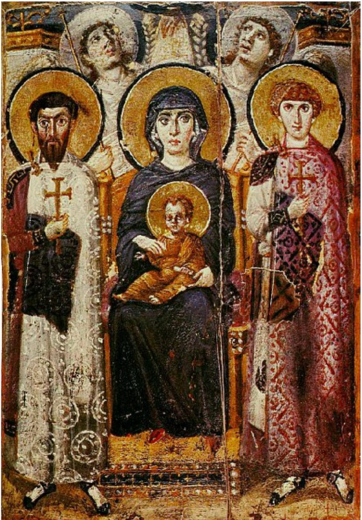
Virgin and Child with Saints and Angels at Monastery of St. Catherine