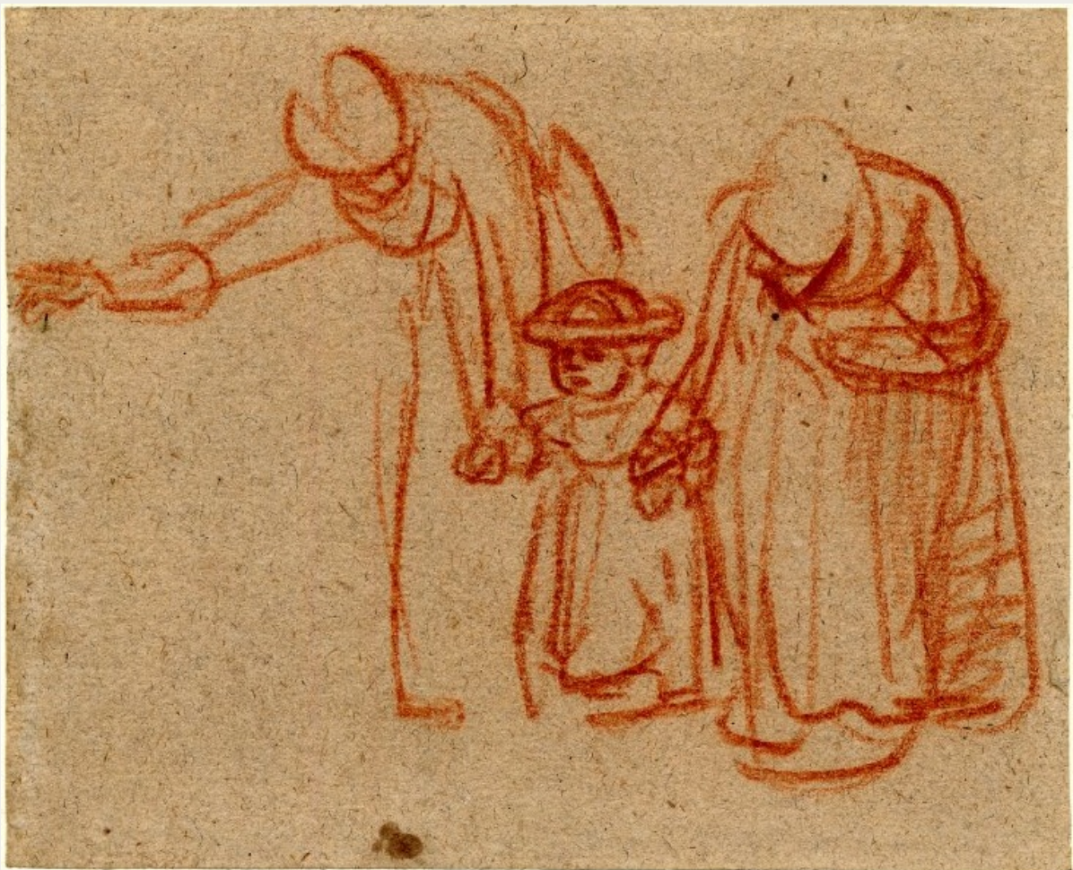
Two Women Teaching a Child to Walk by Rembrandt

Below is a gesture drawing by Rembrandt. Note the lines that capture movement in this image. These are gestural lines.