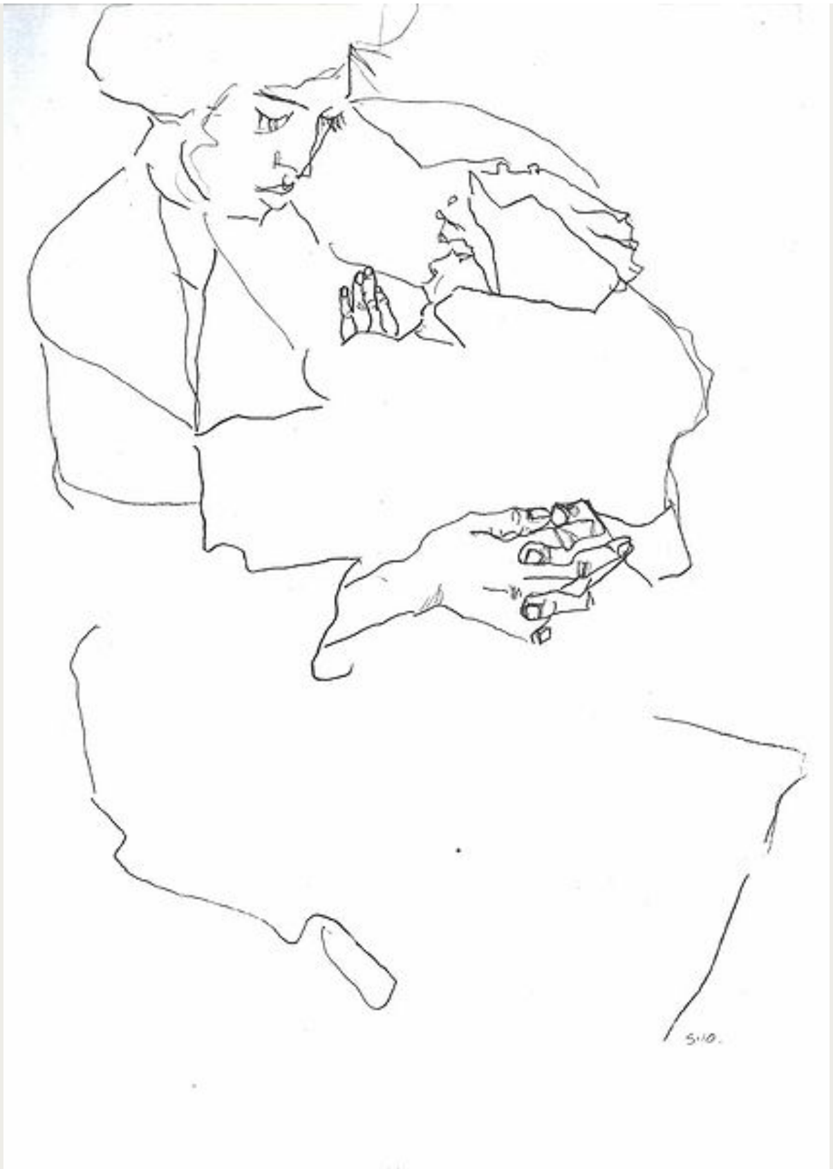
Mutter mit Kind by Egon Schiele