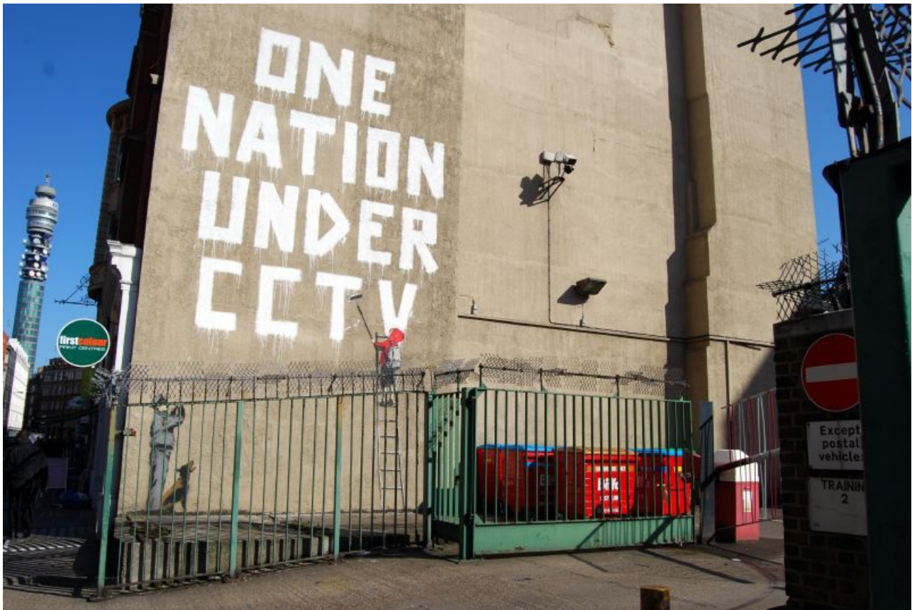
One Nation Under CCTV by Banksy