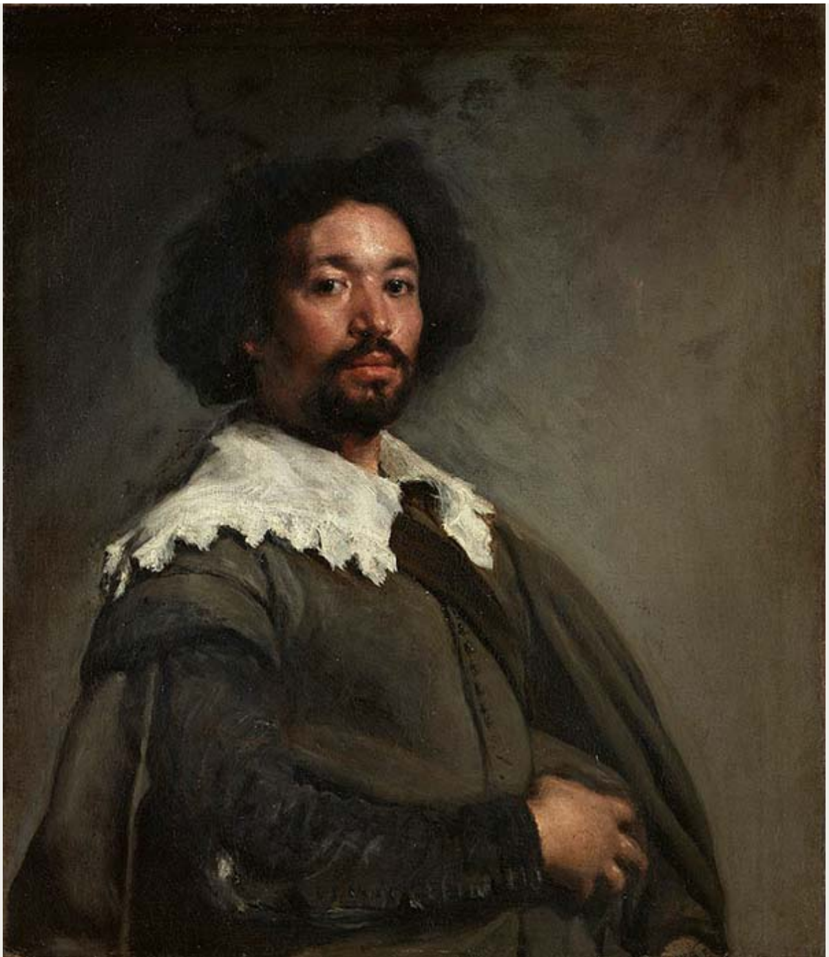
Portrait of Juan de Pareja by Diego Velázquez

And in the last portrait of Sir Thomas More below, you can see that the background of the portrait is a single, flat color. This portrait uses a curtain in the background as a backdrop. The light source is in the upper right-hand corner (notice the yellow lines) and creates an area of shadow between the subject and the curtain on the left, and above his shoulder on the right.