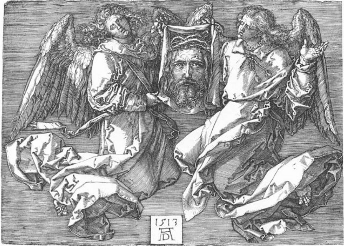
The Sudarium Displayed by Two Angels by Albrecht Durer

When you take a closer look at the image below, you can see the parallel lines that indicate hatching (purple arrow) and cross-hatching (yellow arrow).