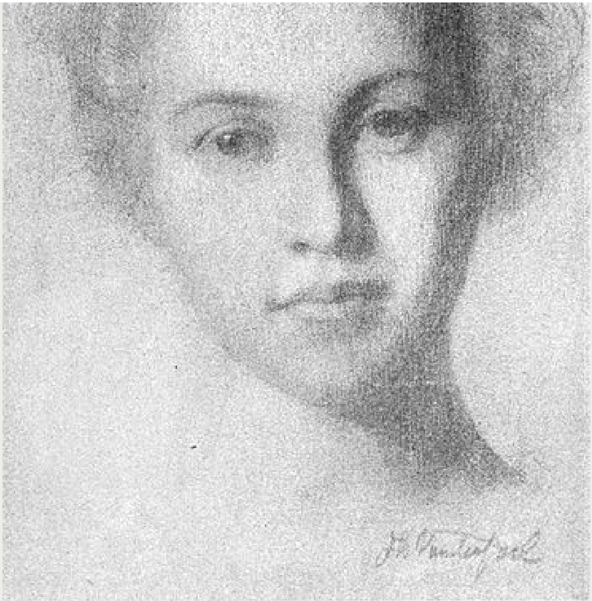
Charcoal drawing of Young Girl by John Vanderpoel

If it is used incorrectly, shadow alone will not make an object appear natural and three dimensional. Typically a single light source for the painting is used as a way to create more dramatic shifts in light to dark. It's this contrast that gives an image visual depth.