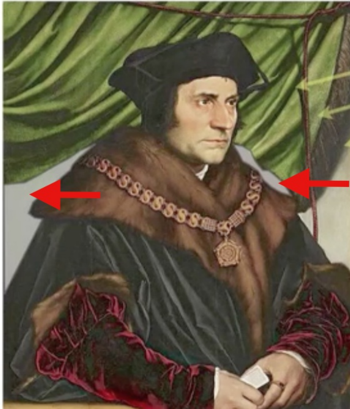
Portrait of Sir Thomas More by Hans Holbein the Younger

The two red arrows indicate an area of negative space , or space between objects, behind him. The negative space is between Sir Thomas More and the curtain. The rendering of negative space is another tool used by artists to suggest depth.