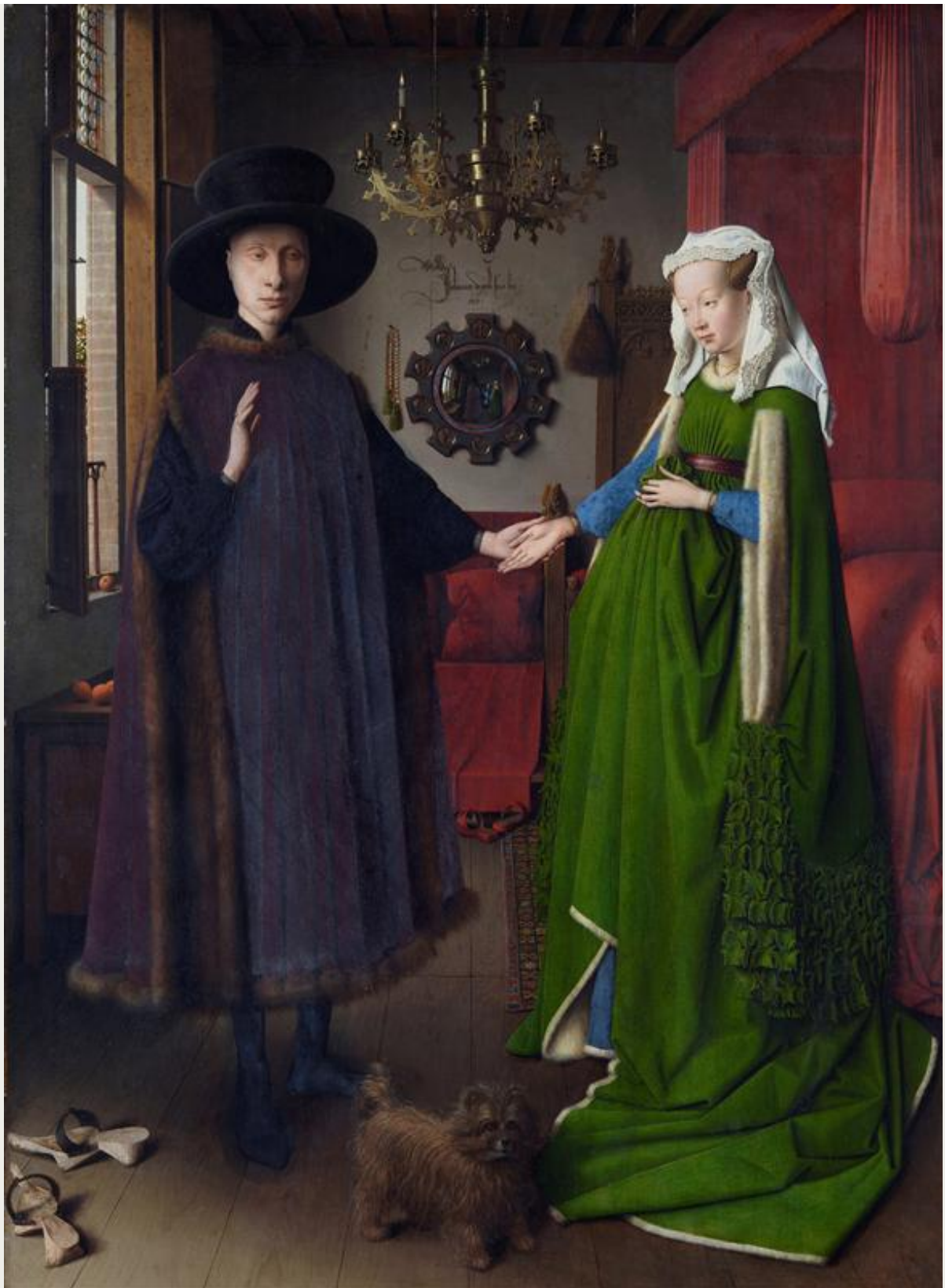
The Arnolfini Wedding by Jan van Eyck