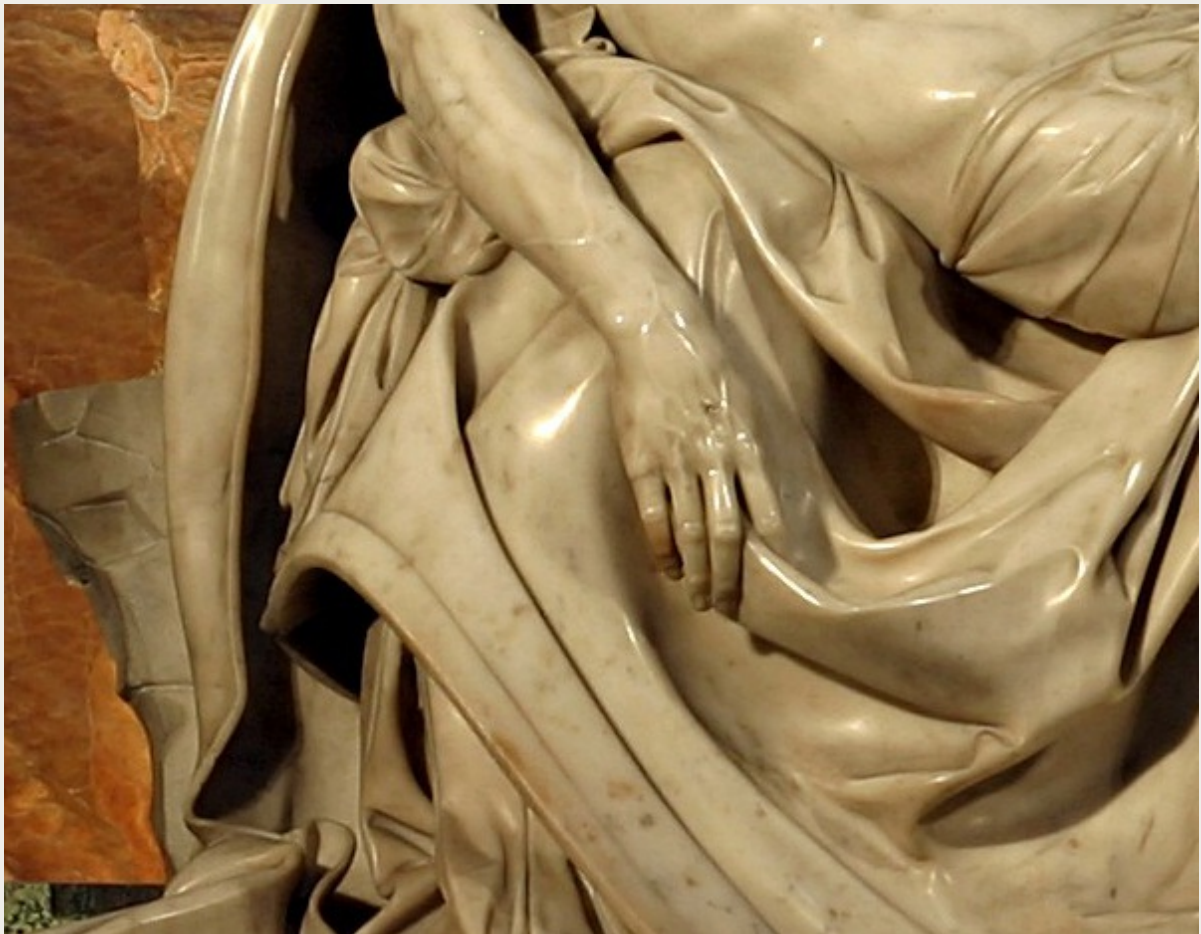
Pietà by Michelangelo

Take a look at the close-up below. Note the fine details in this sculpture made from marble.