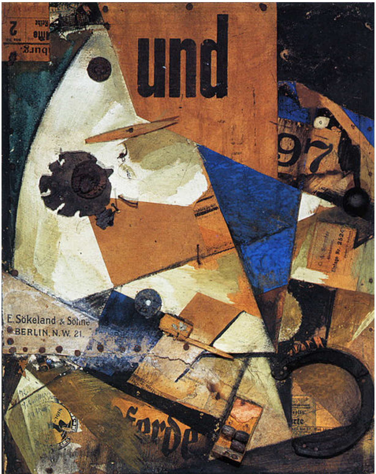
Das Unbild by Kurt Schwitters