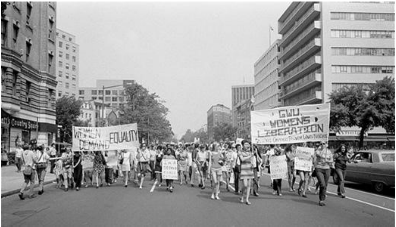
In 1970, supporters of equal rights for women marched in Washington, DC.

Feminism, or women’s liberation, continued throughout the 1970s. Although President Nixon, members of his administration, and the media sometimes ridiculed feminists as “women’s libbers” or focused on their more radical demands, the feminist movement made some notable accomplishments during the decade.