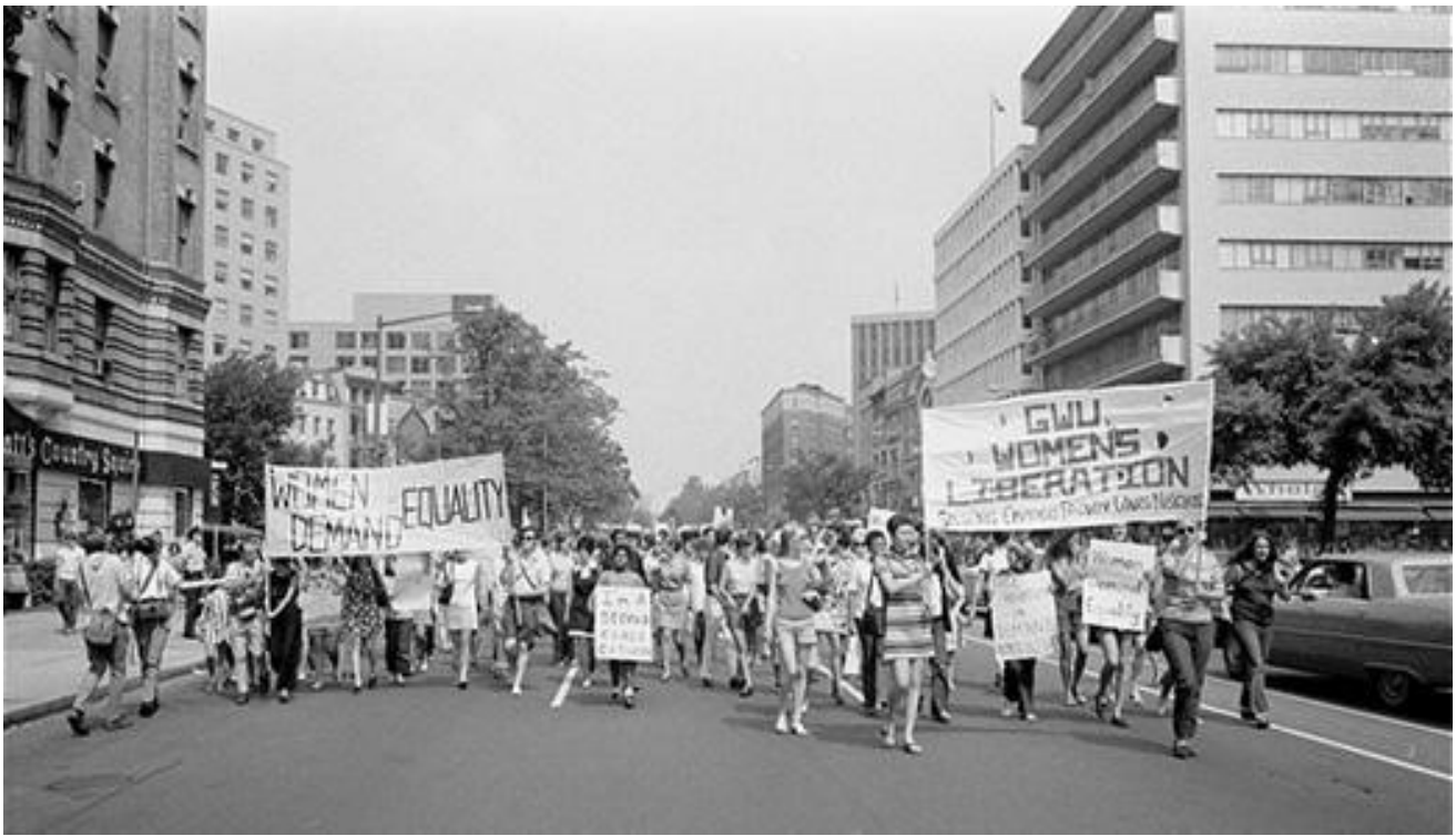
In 1970, supporters of equal rights for women marched in Washington, DC.

Feminism, or women's liberation, continued throughout the 1970s. Although President Nixon, members of his administration, and the media sometimes ridiculed feminists as “women's libbers” or focused on their more radical demands, the feminist movement made some notable accomplishments during the decade.