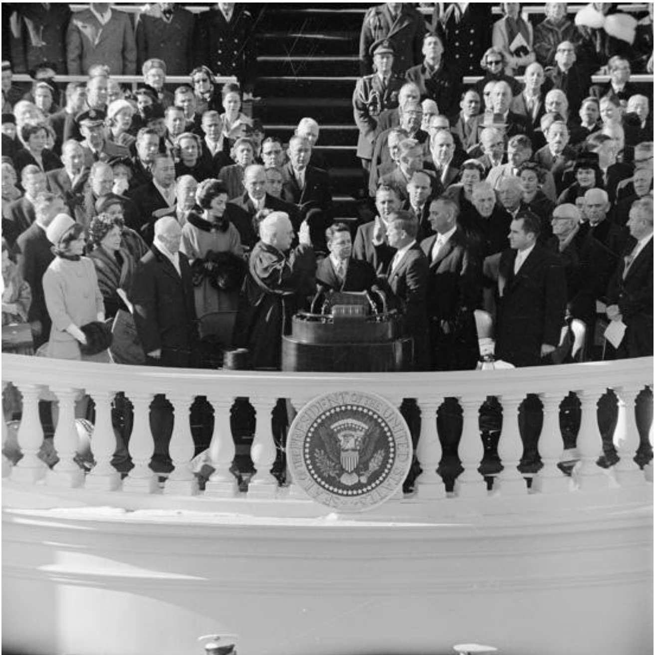
John F. Kennedy takes the oath of office on January 20, 1961.

In his inaugural address (in which he famously stated, “Ask not what your country can do for you; ask what you can do for your country”) Kennedy promised that the United States would continue to protect the interests of the “free world.” Like Eisenhower and Truman, Kennedy fought the Cold War on several fronts through a policy known as Flexible Response .