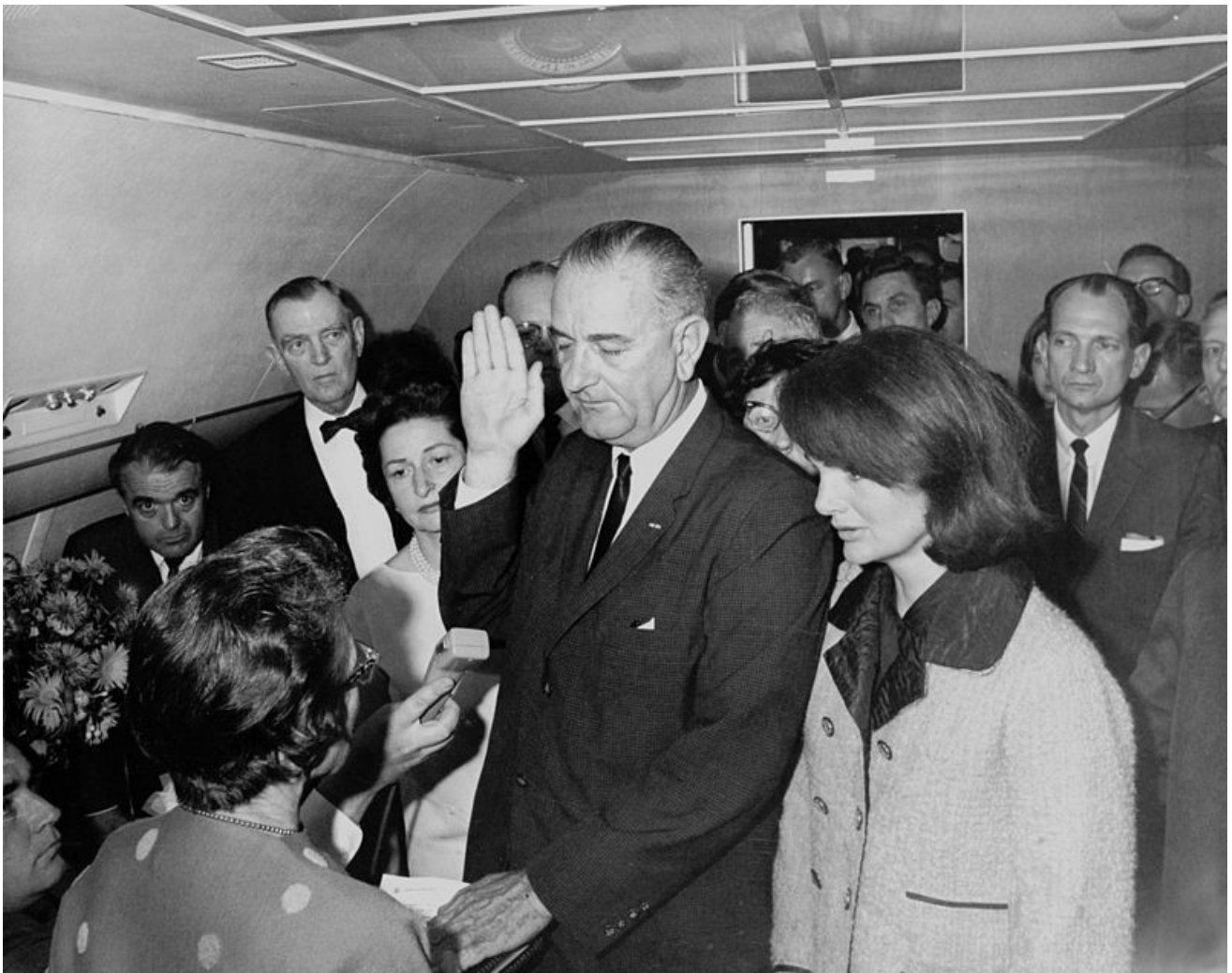
Lyndon B. Johnson (center) takes the oath of office on Air Force One, just hours after President Kennedy's assassination. Jacqueline Kennedy (right) looks on.

By the time of Kennedy's assassination, the civil rights bill had been passed in the House of Representatives, but it was stalled in the Senate. Johnson, who was the Senate majority leader before becoming vice president, used his political influence and the memories of his fallen predecessor to end a filibuster that had been launched by 18 Southern Democratic Senators and one Republican to prevent its passage. On July 2, 1964, Johnson signed the Civil Rights Act of 1964 into law.