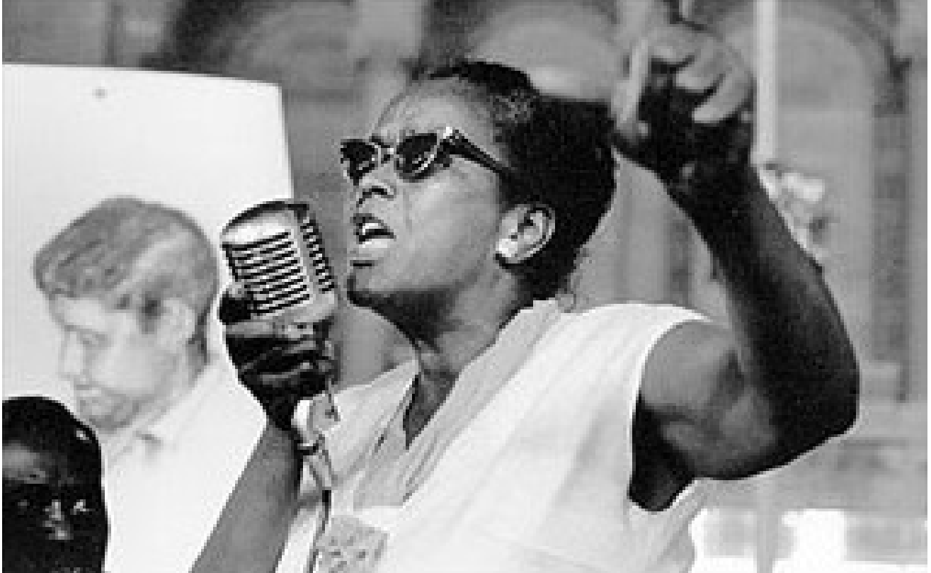
Photograph of Ella Baker, one of the founders of SNCC.

Formed by students and activists in April 1960 to coordinate sit-ins and other demonstrations on behalf of civil rights.