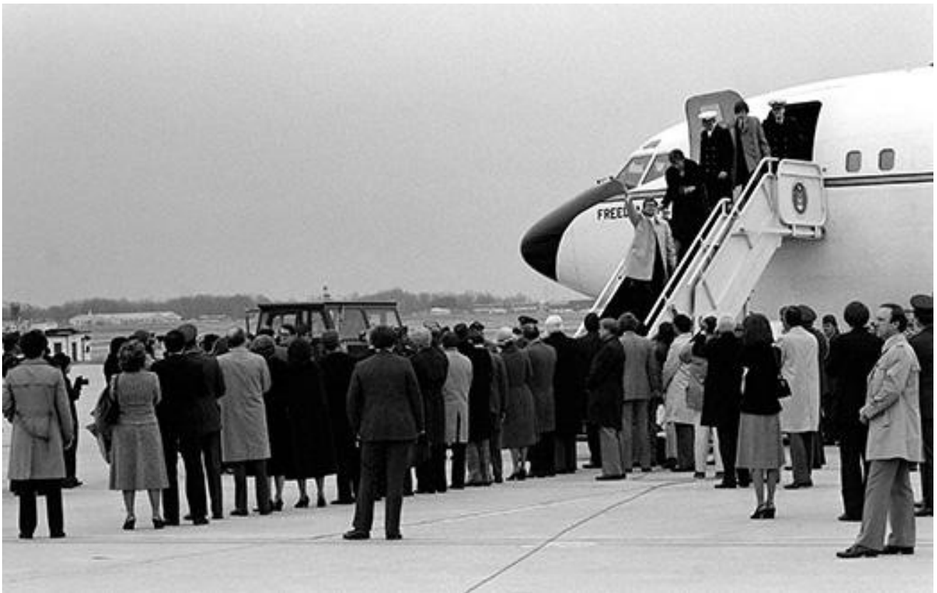
American hostages return from Iran in January, 1981.

The hostages had been held for 444 days. They were captured in November 1979 during the Iranian Revolution when an anti-American, Islamic theocratic government led by Ayatollah Khomeini took control of Iran.