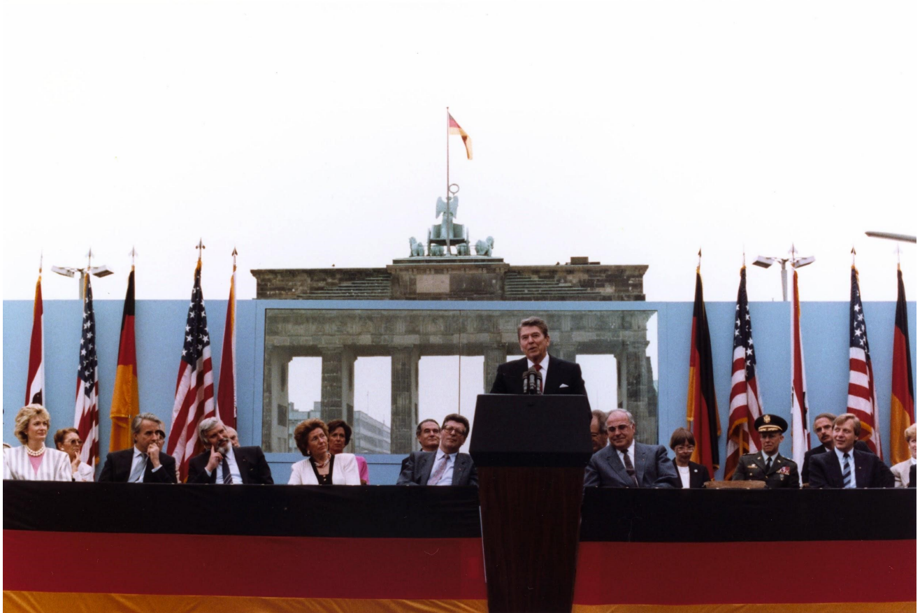
Ronald Reagan spoke in front of the Brandenburg Gate and the Berlin Wall on June 12, 1987.

Reagan made the following remarks while standing before the Brandenburg Gate in West Berlin: