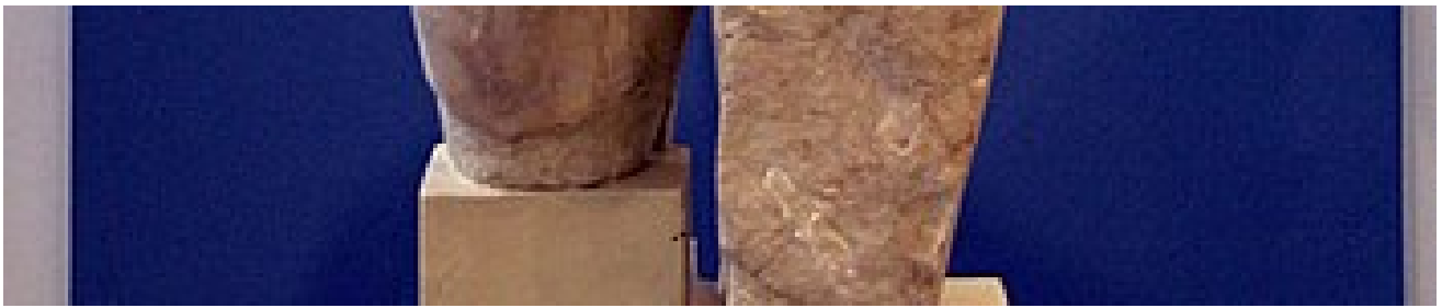
Calf Bearer (from the Acropolis)