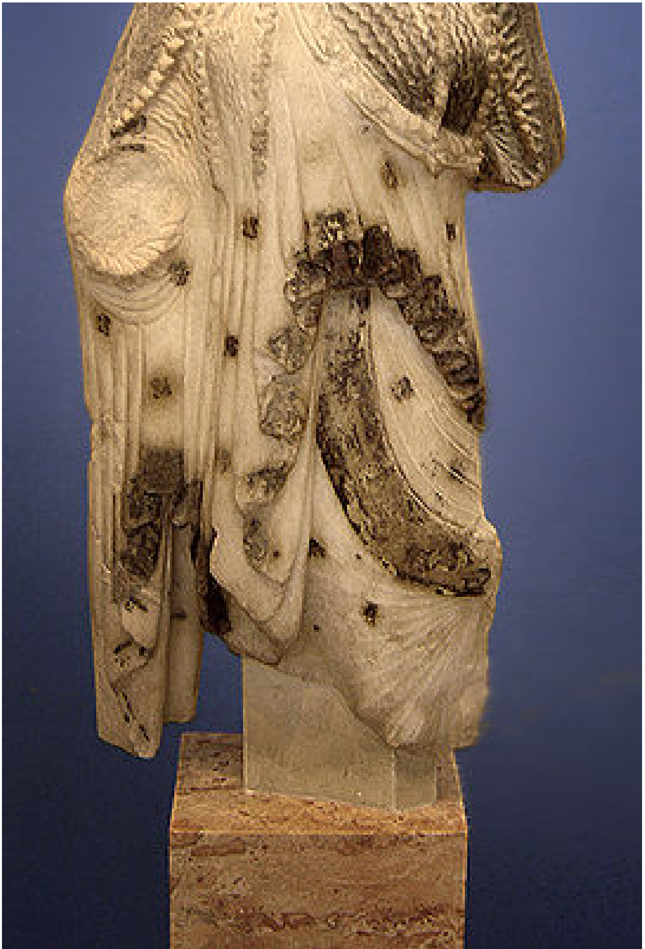
Kore from Acropolis