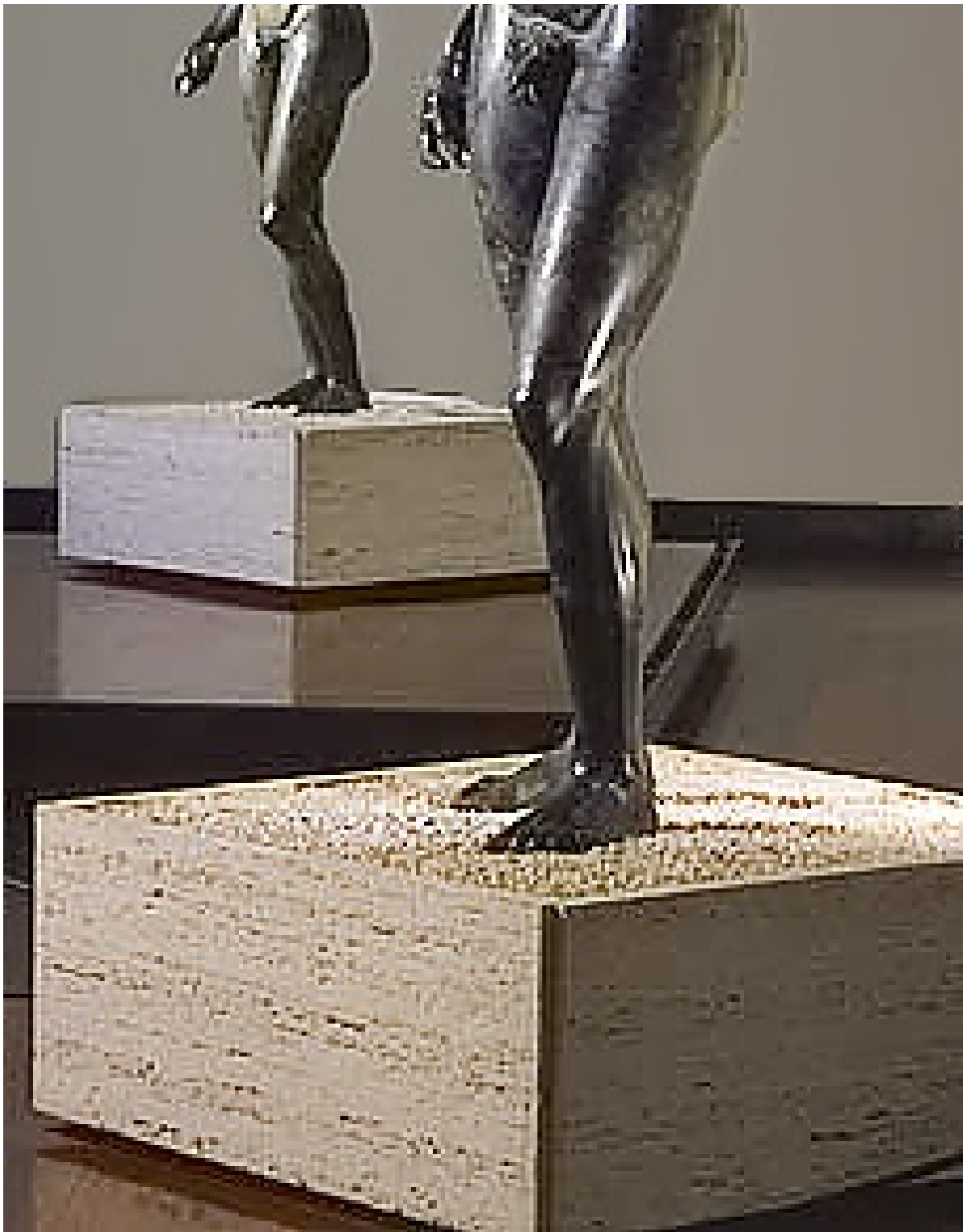
Warrior from Riace