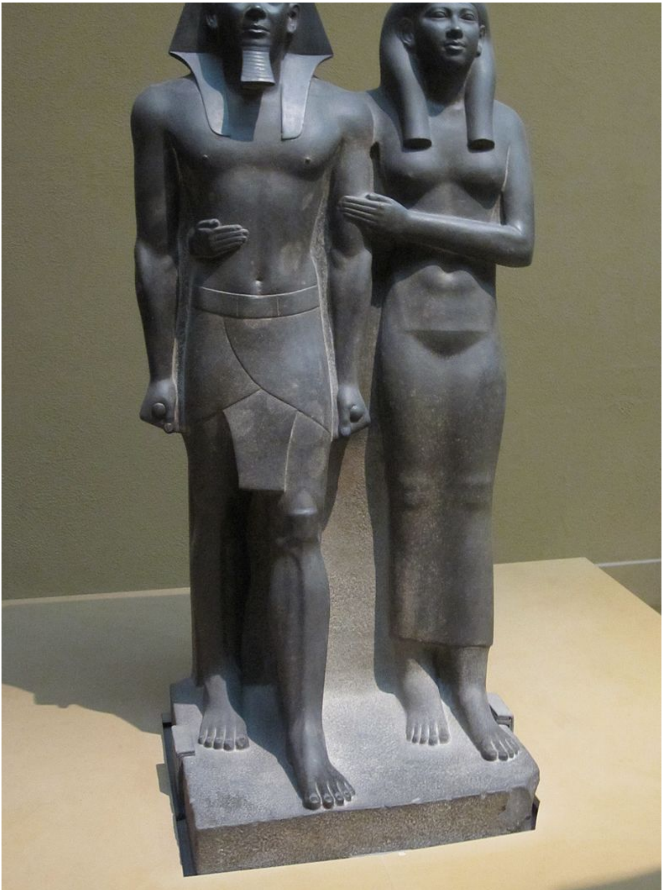
King Menkaure (Mycerinus) and Queen