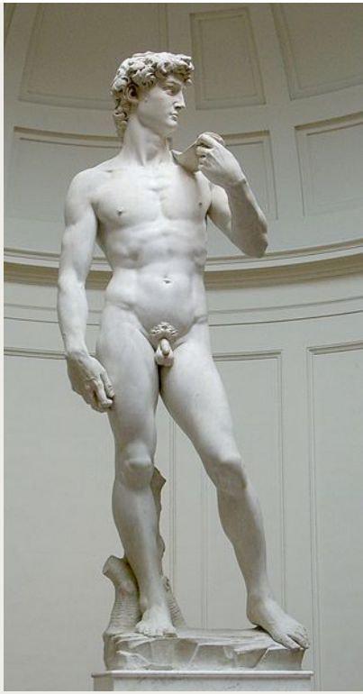
David by Michaelangelo