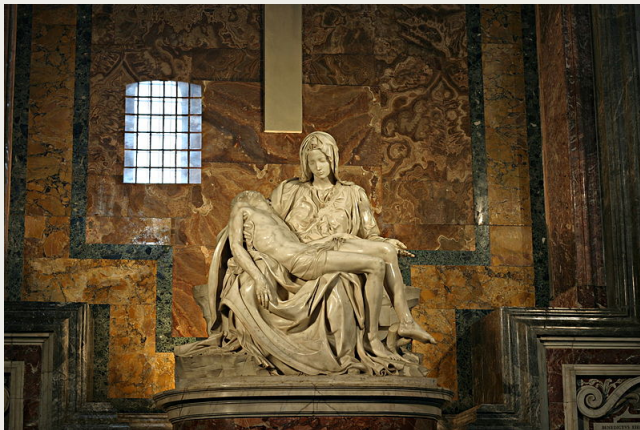
Pietà by Michaelangelo

These are just some examples from his oeuvre, and they prove him to be exceptionally talented. Therefore, the unanimous consensus among scholars is that he was a genius. You would have a hard time convincing anybody in the field that Michelangelo was a hack.