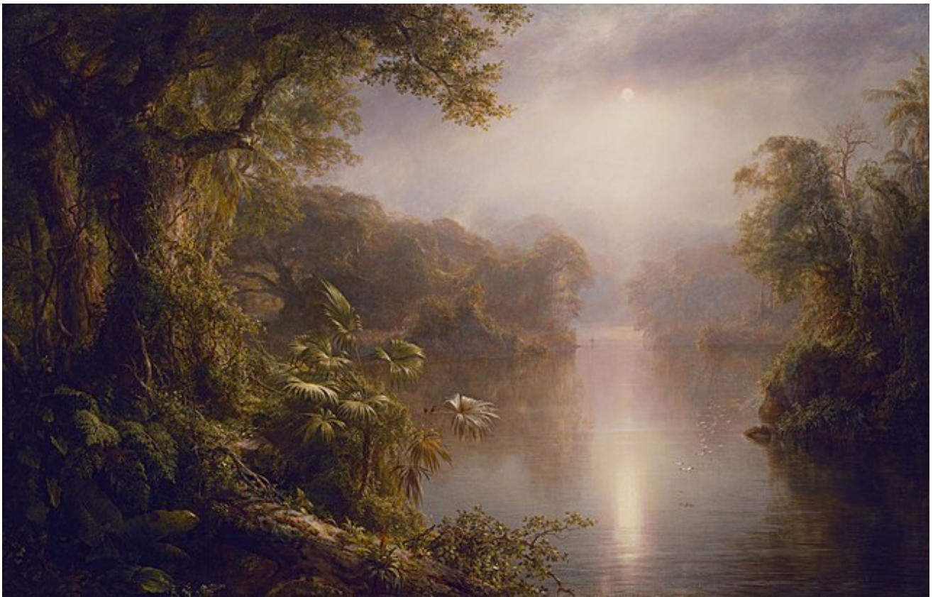
The River of Light by Frederic Edwin Church

Looking at each of the two paintings above, you can ask questions such as: