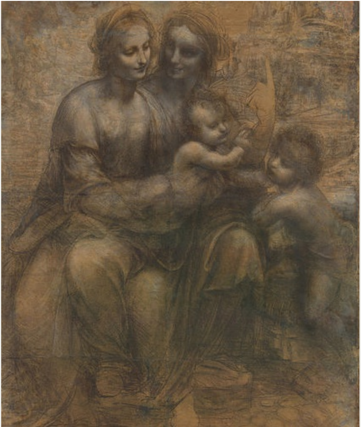
Chalk drawing of St. Anne by Leonardo da Vinci

Here is an example of a drawing using pastels: