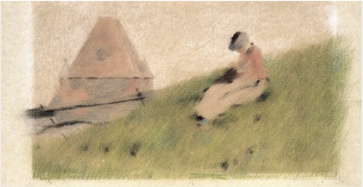
Pastel drawing of On the Cliff by Theodore Robinson

Below is one more example of a drawing, this time using charcoal.