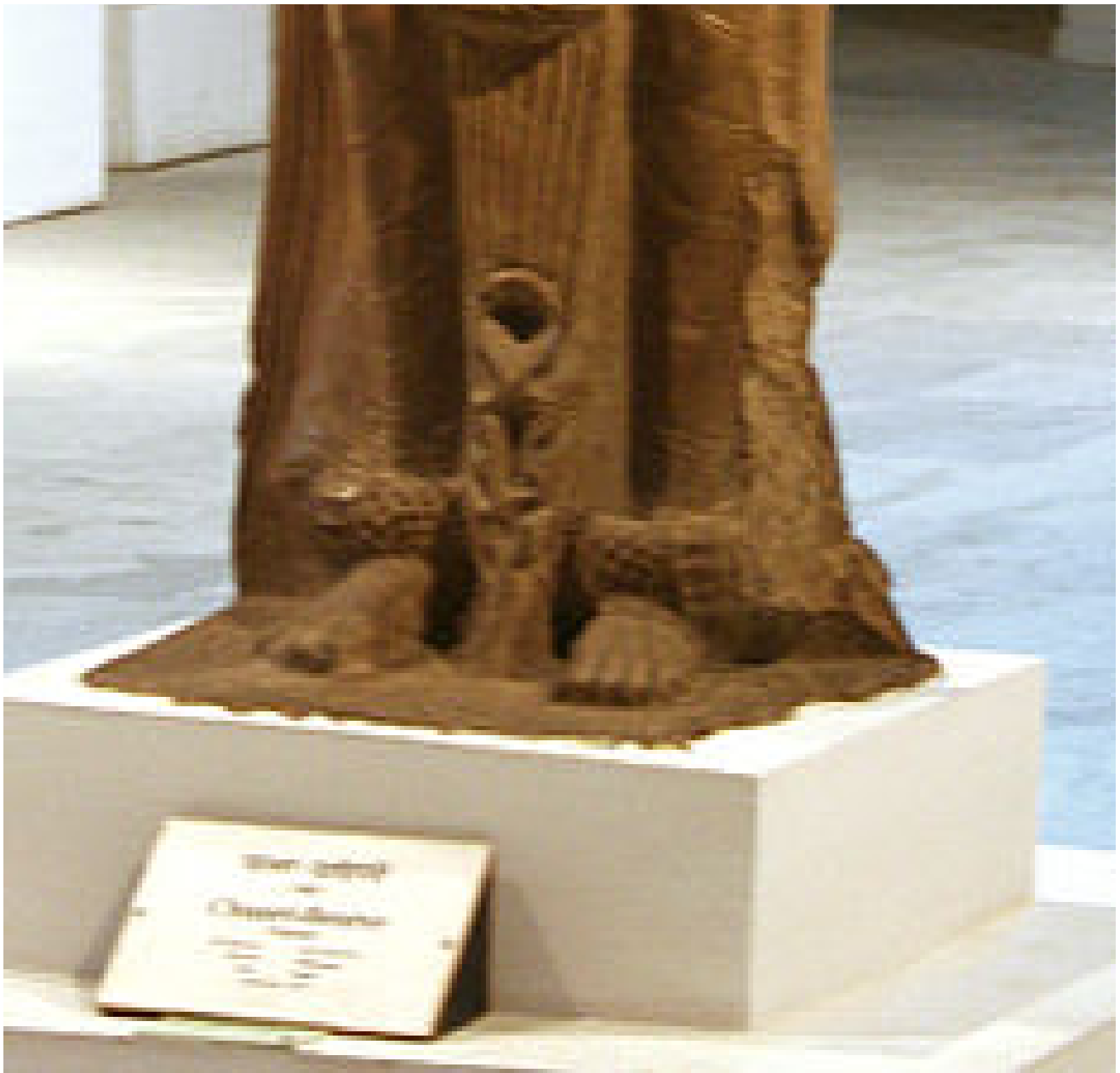
Yakshi Holding a Fly Whisk