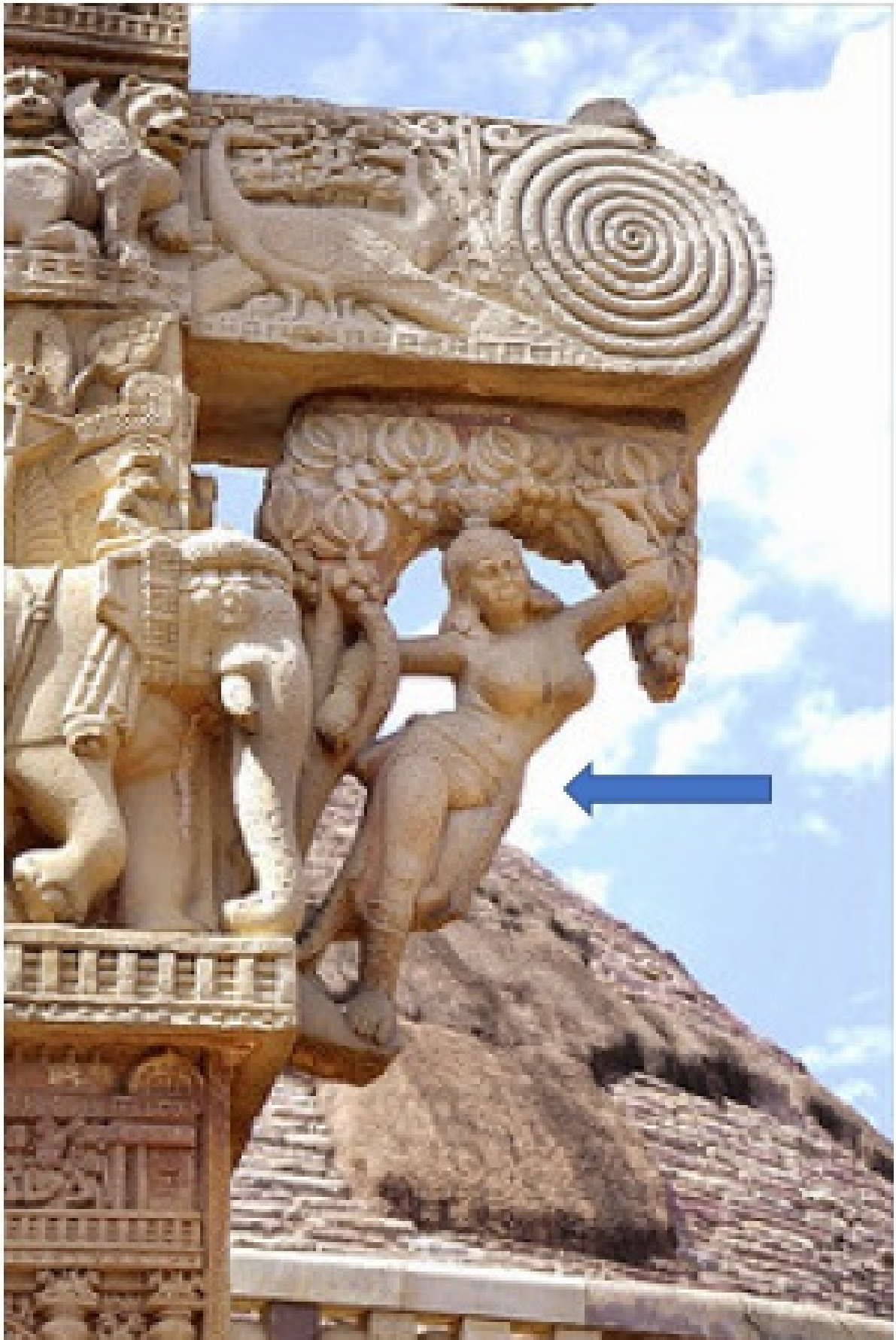
Yakshi at eastern torana of the Great Stupa of Sanchi

➞ EXAMPLE This image is of a yakshi located at the eastern torana of the Great Stupa of Sanchi.