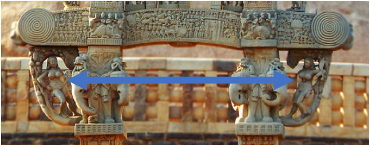
Two Yakshi at northern torana of the Great Stupa of Sanchi

➔ EXAMPLE The following image is of two yakshi located at the northern torana of the Great Stupa of Sanchi.